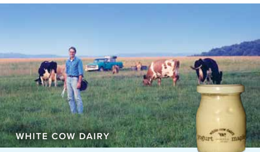
WHITE COW DAIRY

NY RANKS FOURTH AMONG THE U.S. IN TOTAL CHEESE PRODUCTION